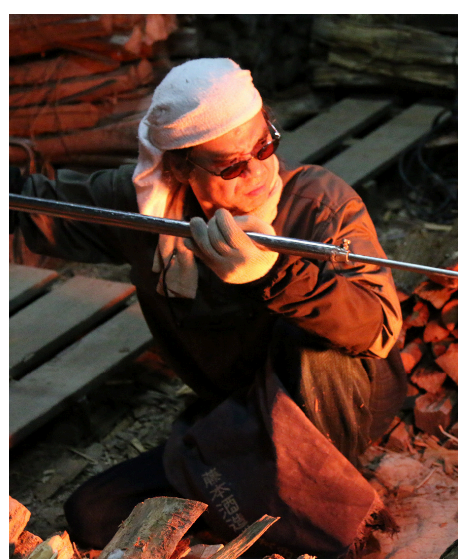
Tanii Hozan Japanese Master