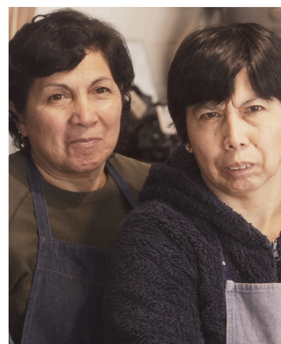
Widulafquen Potters from Lake Panguipulli in Southern Chile