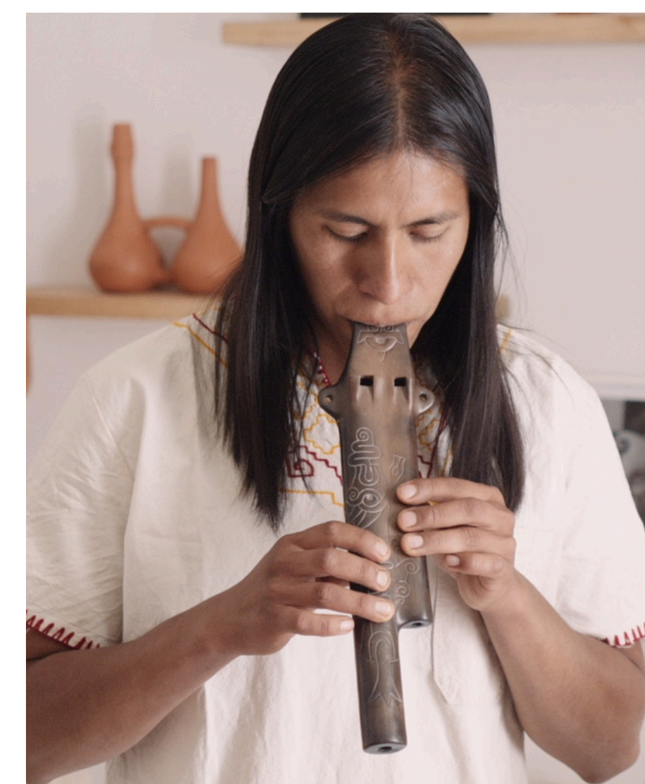
Taki Runa Sound Ceramist in Peru